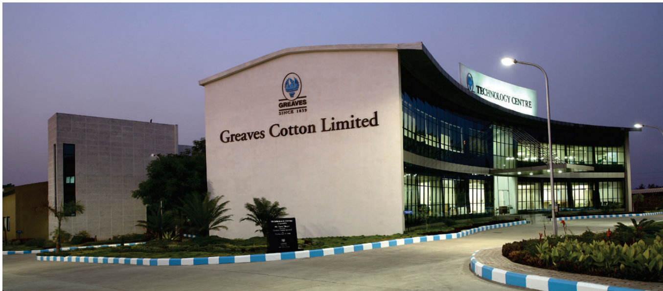
Technology Centre, Aurangabad