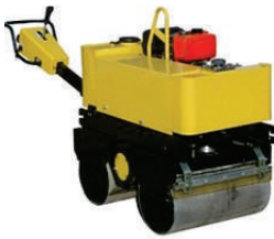
Walk Behind Roller