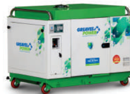
7.5 KVA Genset