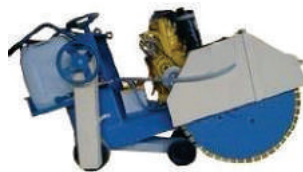
Road/ Kerb Cutting Machine