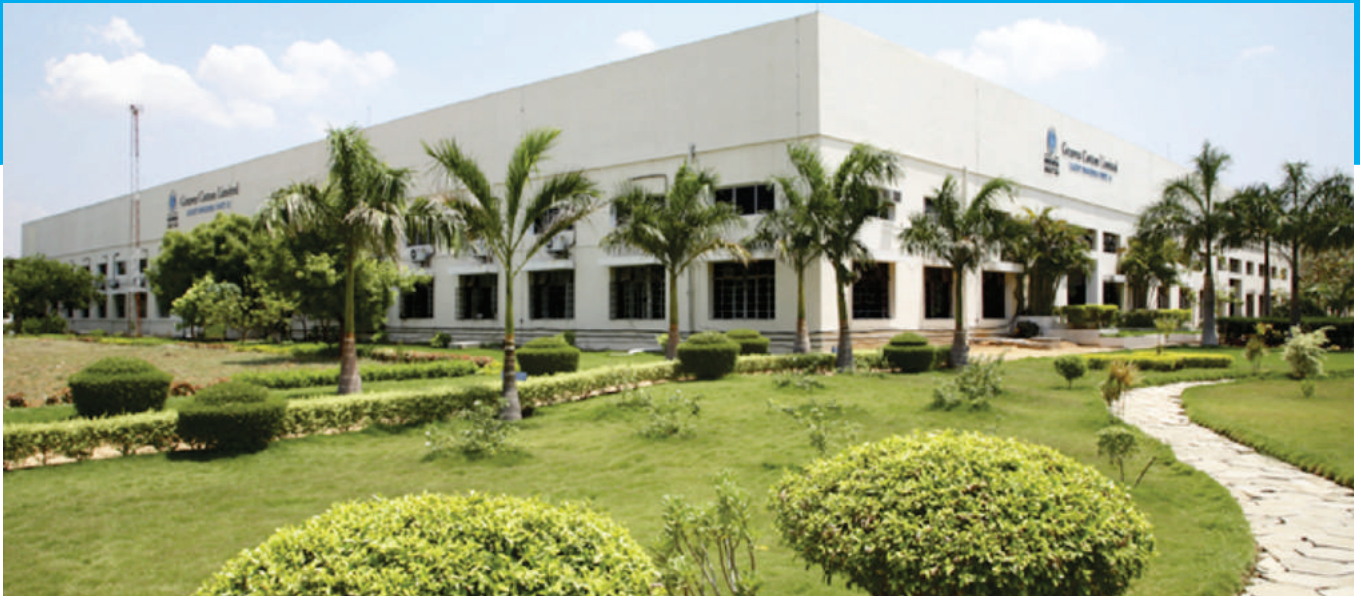
Ranipet (Chennai) Factory