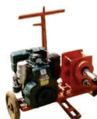
Sewage Rodding Machine