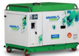
5 KVA Genset