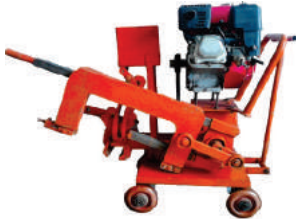
Rail Cutting Machine